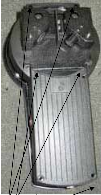
Figure 1: Remove six screws