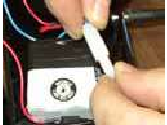
Figure 2B: Reconnect battery from nylon connectors. NOTE: DO NOT PULL ON WIRES.